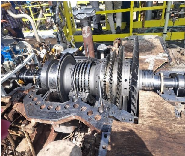
Air Compressor Turbine, TK-421 Overhauling