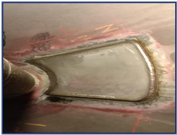
Urea reactor, R-101 Rehabilitation