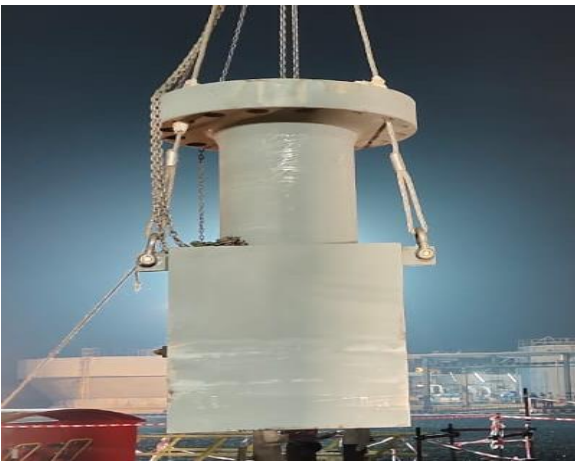
Ammonia Reactor, R-501 New Bottom