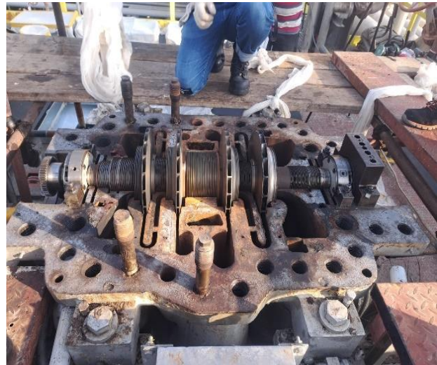
Air Compressor, K-421 HP Stage Overhauling