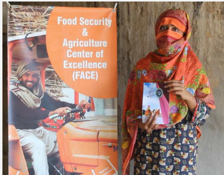
Distribution of poultry and guidebooks on Household Poultry Management among household women of Ahmedpur Lamma

Food Security and Agriculture Center of Excellence (FACE) in its livelihood campaign has distributed 75,000 free-of-cost day-old German Lohmann breed chicks among the local community of Ahmedpur Lamma, Rahim Yar Khan on 5 th July 2021.