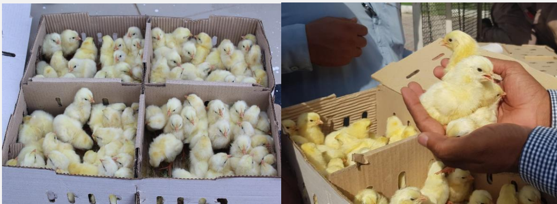
Day-old German Lohmann Breed chicks distributed among beneficiaries