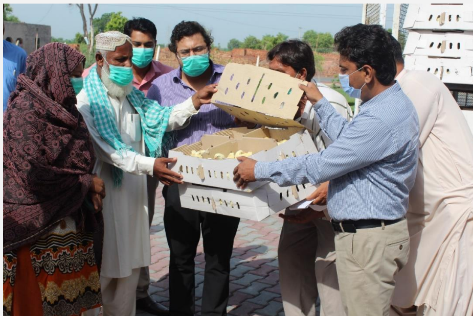
Distribution of poultry at APL