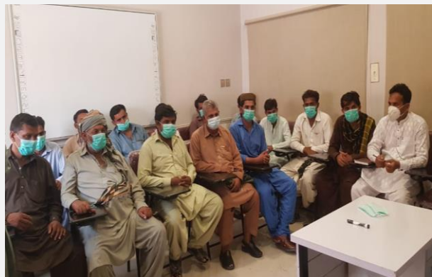
Capacity building sessions of beneficiaries conducted by FACE and Livestock Department at FACE APL prior to distribution activity