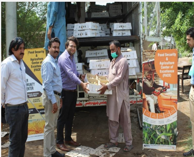
Distribution of poultry among beneficiaries in Chak 63, Sadiqabad