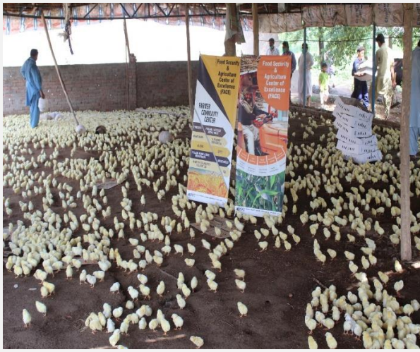
Shed rented by group of beneficiaries for raising of chicks