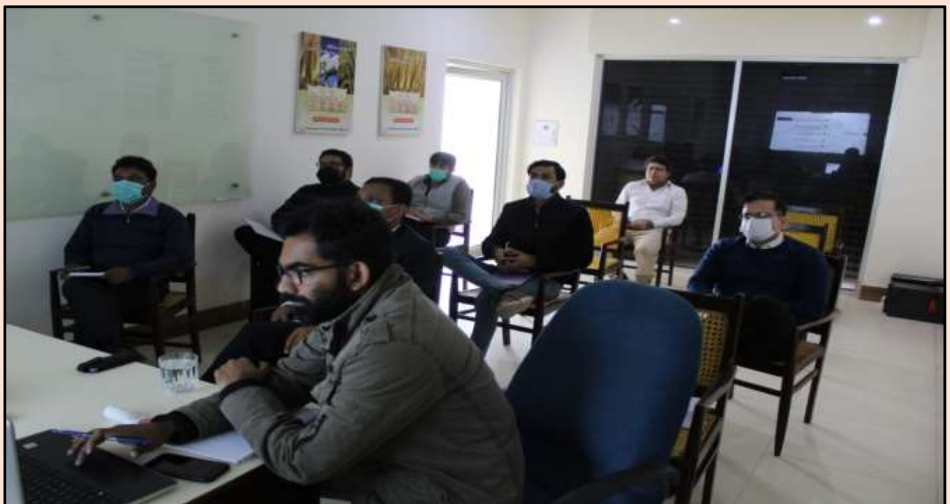
SFL Team from Ahmedpur Lamma