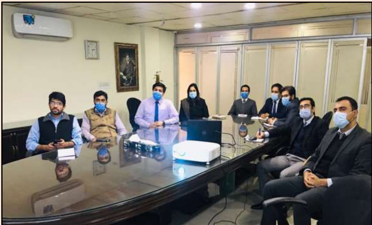
FACE Team Marketing Group Office Lahore