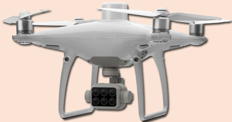
Phantom 4 Multispectral Drone