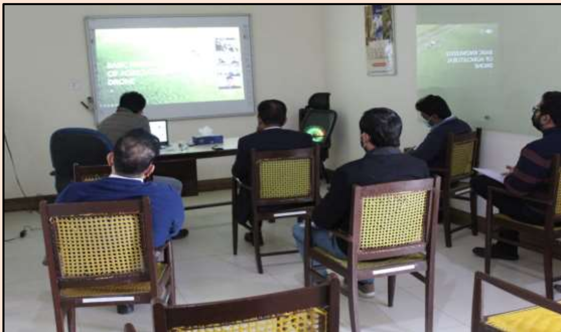
Sapphire Team attending the session