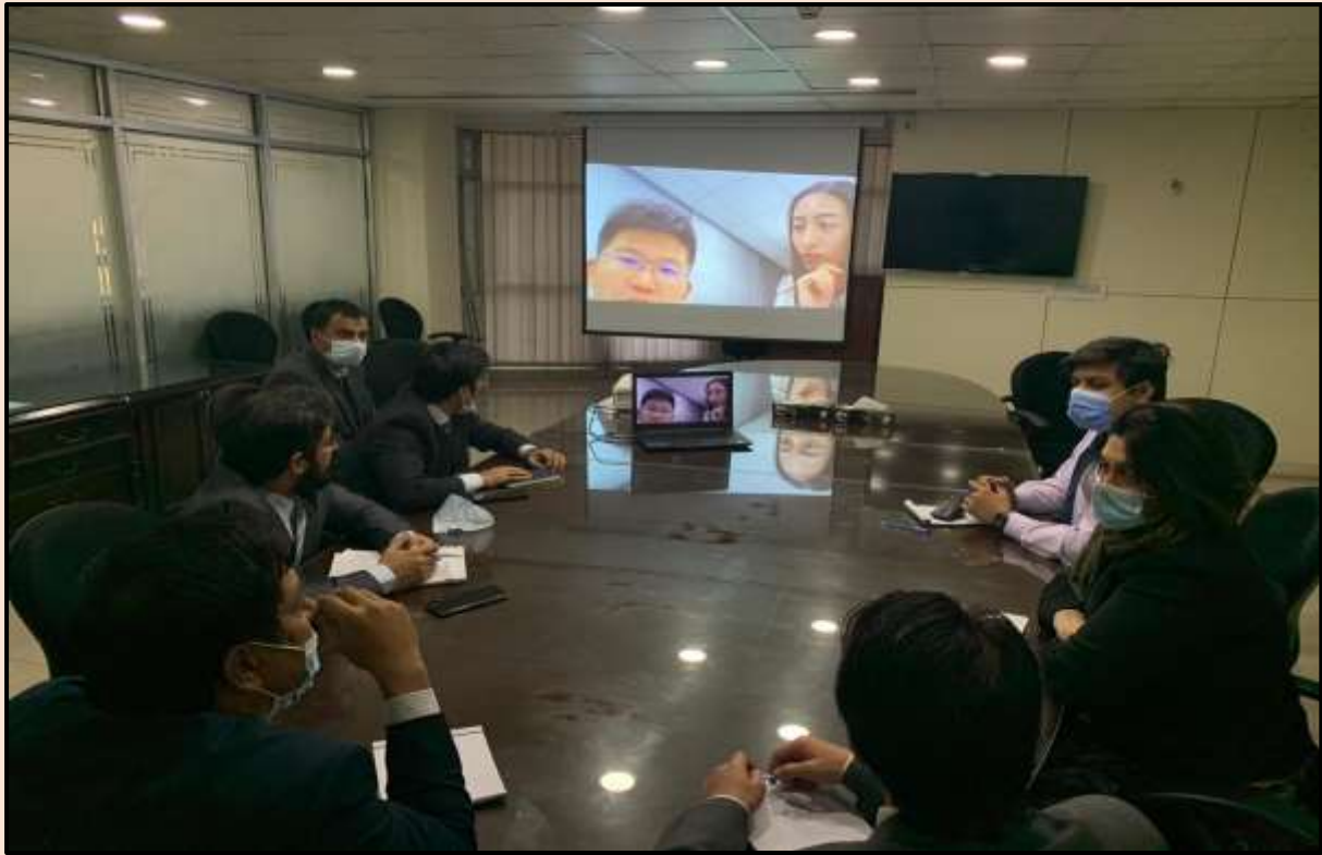
FACE Team attending the Zoom session

Food Security & Agriculture Center of Excellence (FACE) in collaboration with Sapphire Farms Limited and DJI China, the largest manufacturers of drones in the world arranged for 2-day product trainings on the newly acquired hexa-copters on 17 th and 18 th of December 2020.