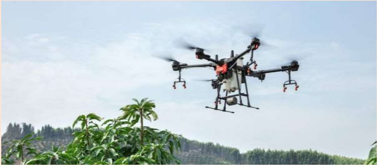
DJI Agras T16 Hexa-copter