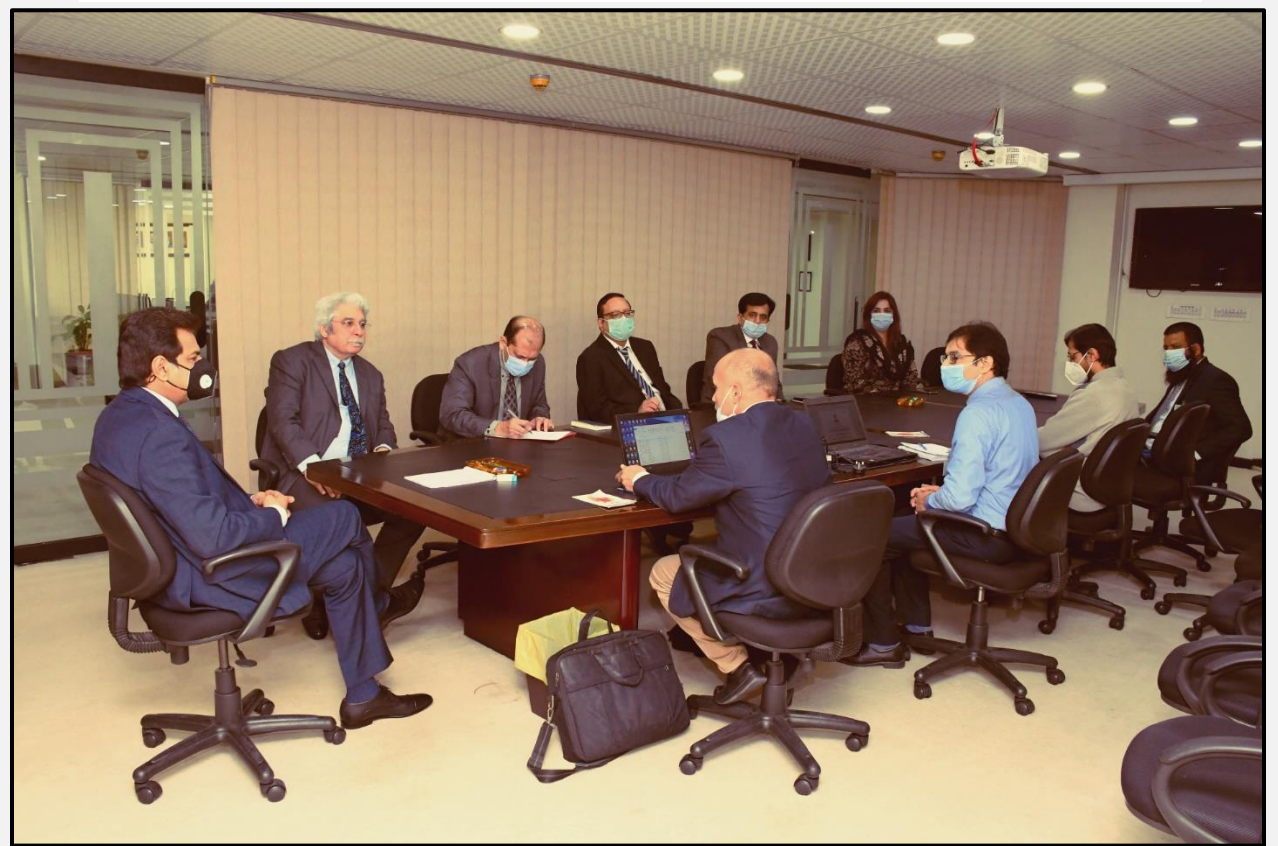
Opening meeting with the top management.