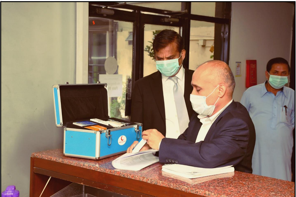
Reviewing the Medical First Aid Kit