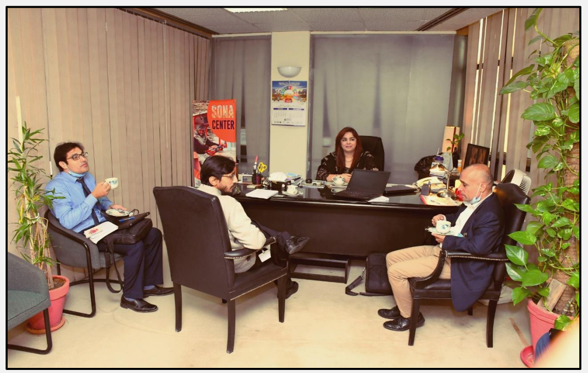
Execution of formal proceedings by the Auditors from Bureau Veritas

IMS Marketing Group Office Lahore successfully administered a Recertification Audit on 1<sup>st</sup> and 2<sup>nd</sup> December 2020. A group of 4 Auditors from Bureau Veritas (Pvt) Ltd conducted a detailed Audit of the Marketing Group.