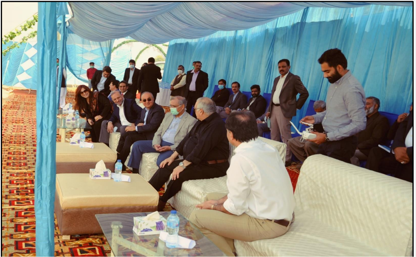
DJI China Certified Hexacopter Pilot (BSc Mechatronics—NUST) demonstrating the functions of Hexacopter and Phantom 4 Multispectral drones (13 will be acquired by the end of December)