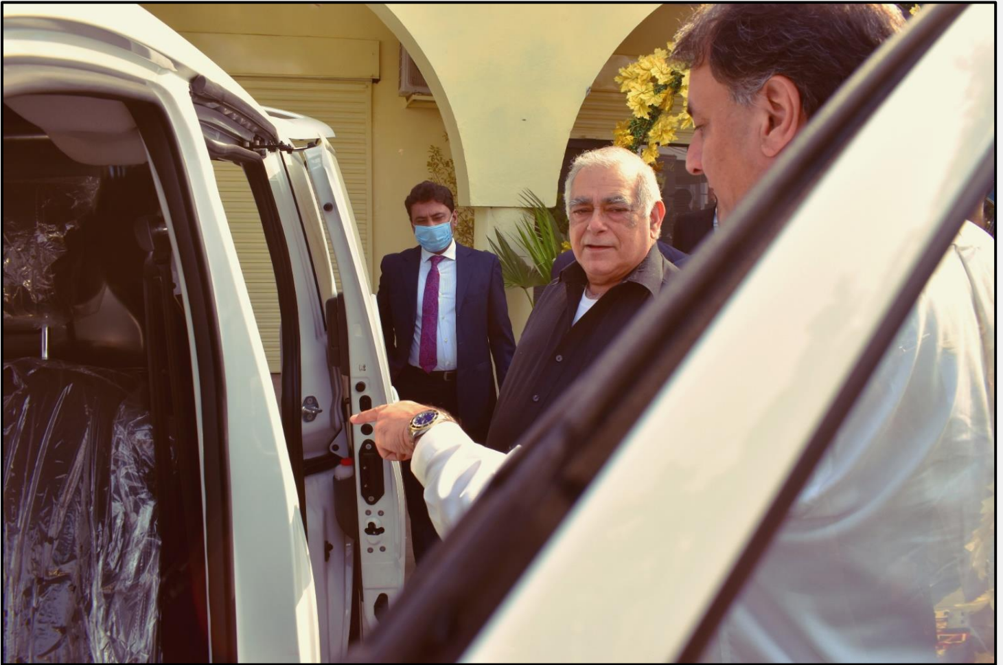
Chairman FACE being briefed on the capabilities of Electric Vehicles