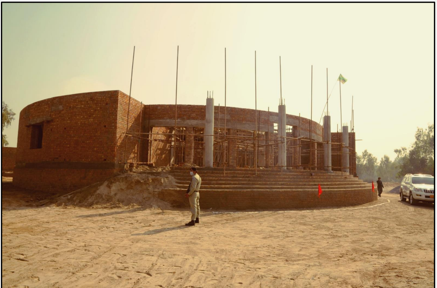
Construction site- FACE Building- Ahmedpur Lamma