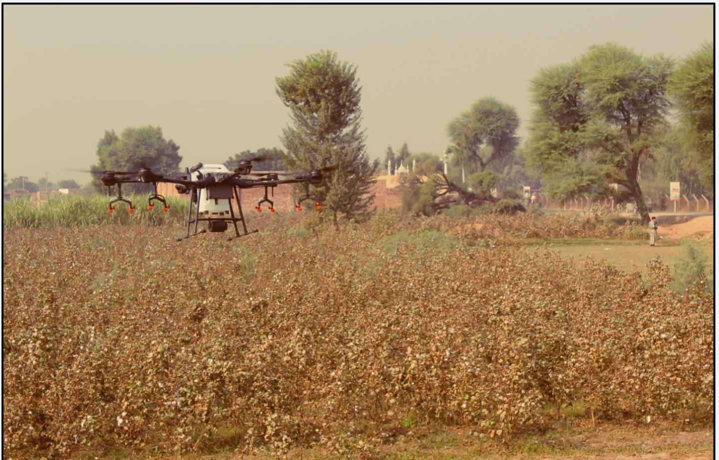
Demonstration of Hexacopter Agras T-16