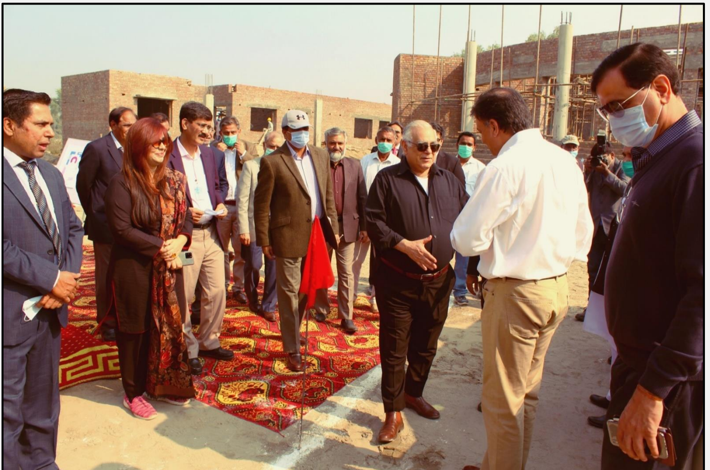
CE&MD appreciates the progress of the project