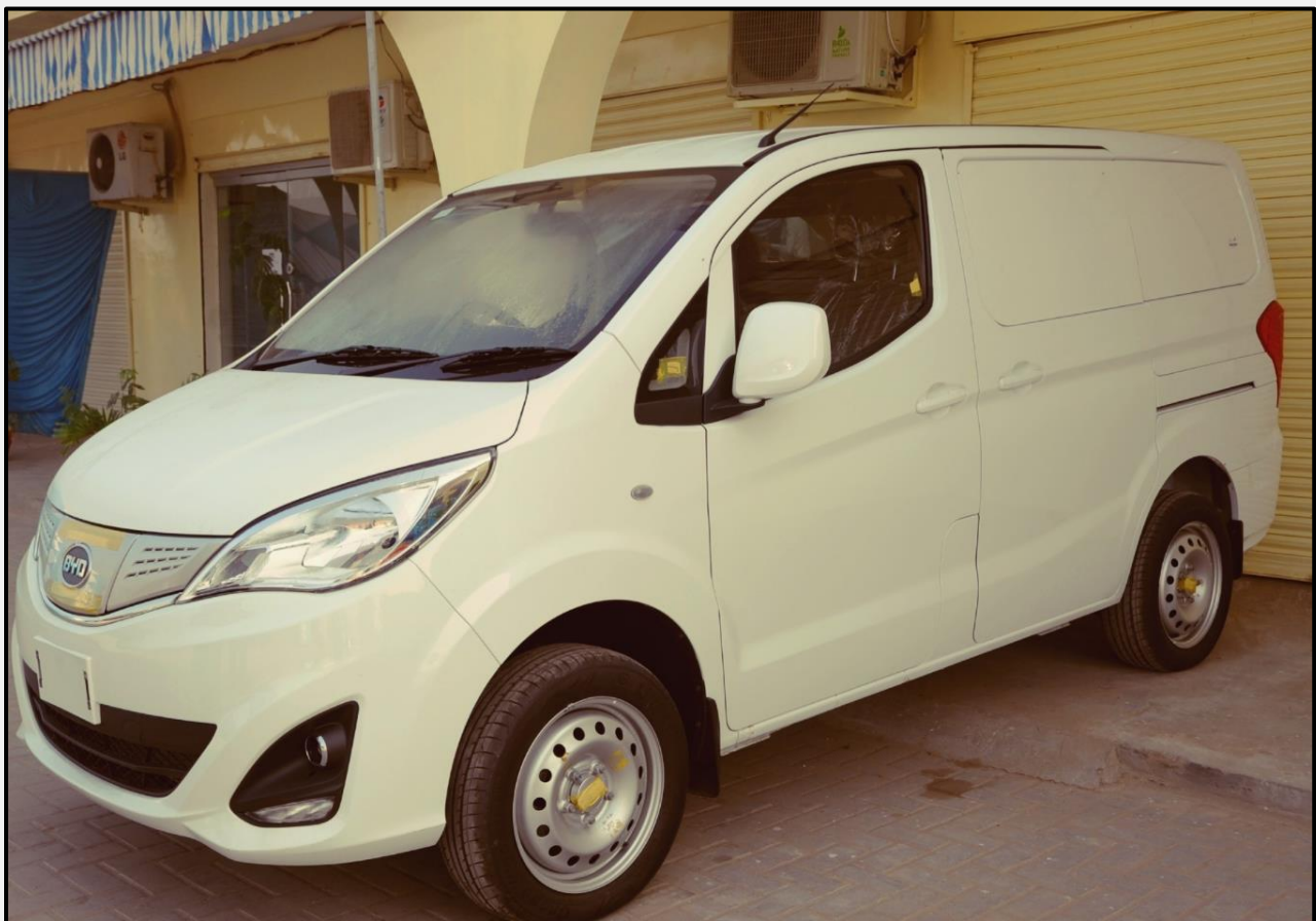
Demonstration of Electric Vehicles