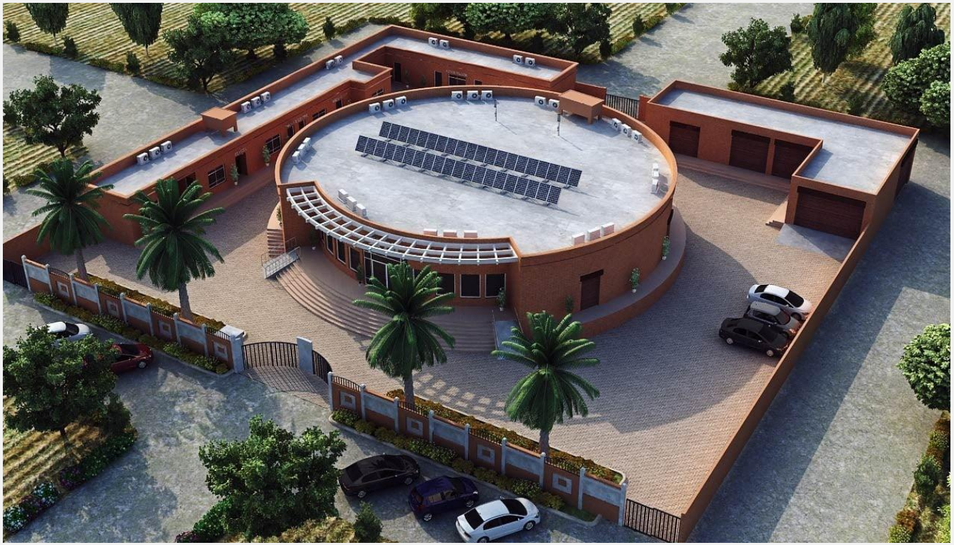
3-Dimensional view of FACE building – APL

The CE&MD FFC took note of the progress of the under-construction building for FACE in the region, congratulated the FACE team and also met the stakeholders on his visit to explore new avenues and to determine the way forward.