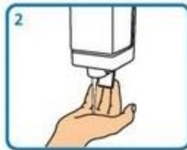
Apply enough soap to cover all hand surfaces