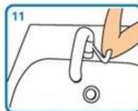
Use elbow to turn off tap