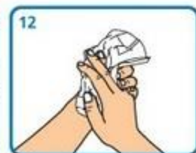
Dry thoroughly with a single-use towel