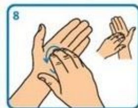
Rub tips of fingers in opposite palm in a circular motion