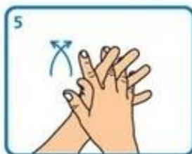
Rub palm to palm with fingers interlaced