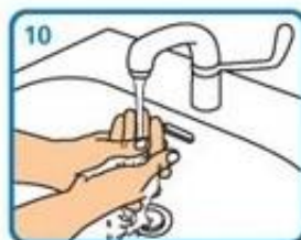
Rinse hands with water