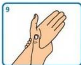
Rub each wrist with opposite hand