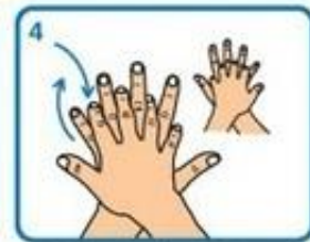
Rub back of each hand with palm of other hand with fingers interlaced