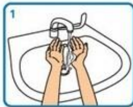
Wet hands with water