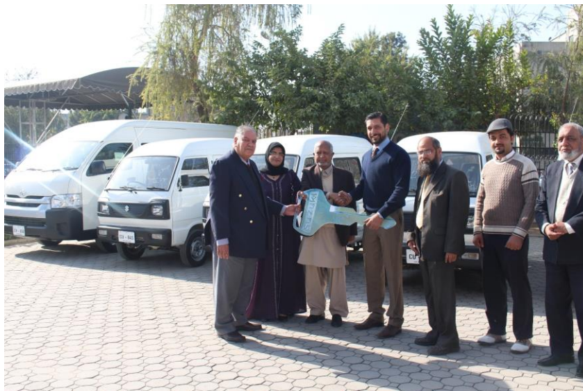
Handing Over Ceremony of Vehicles to Tameer e Millat Foundation